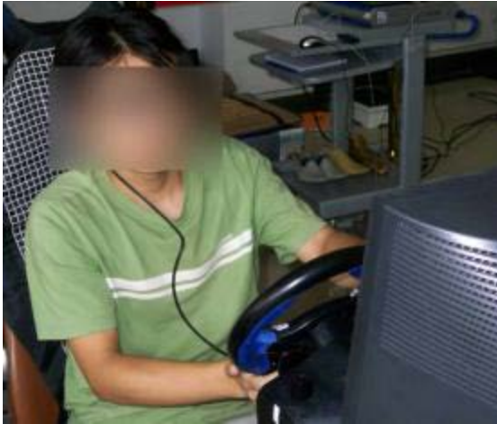
Figure 1: Experimental scene

The experiment is finished in similar two sessions of human physiology cycle: 9:00~12:00 AM and 2:00~5:00 PM. Maintain environment temperature at 22 \pm 2 centigrade, make sure the virtual driving environment has good light and keep quiet in the process of experiment. Collect the ECG signal in the way of Chest-linked method, after pasting the electrode, we helped the subjects to wear the helmet eye tracker and adjust to the appropriate location to capture the eye image. Obtained the ECG signal as standard after the subjects sat 10 minutes naturally. Virtual driving task lasted 120 minutes, and we recorded ECG and eye movement signals according to time sequence in a virtual driving the process. Experiment process is shown in Figure 1.